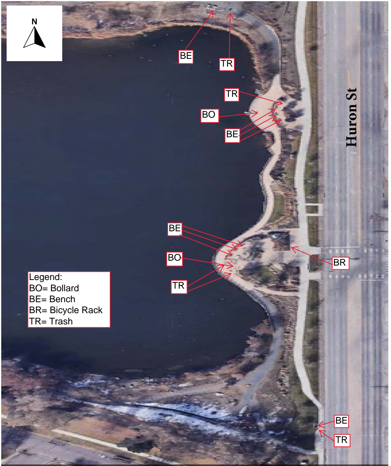
Locations of Miscellaneous Items to Paint