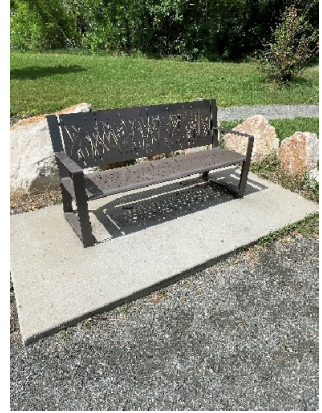
Bench (Type 2)