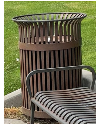
Trash Receptacle (Type 2)