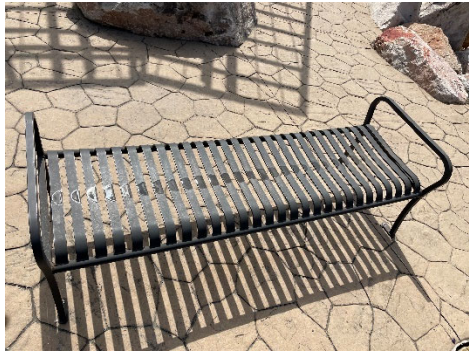
Bench (Type 1)