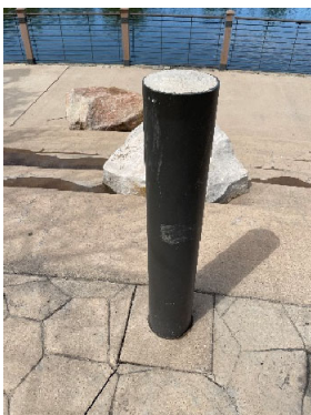
Bollard (Type 1)