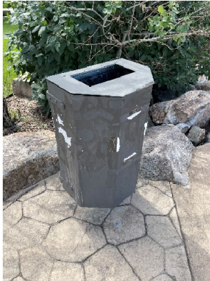
Trash Receptacle (Type 1)